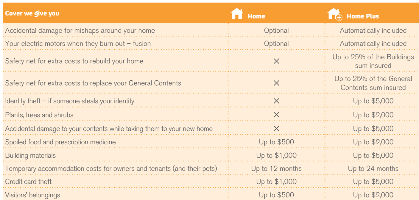
Table 1.1 – Differences between a Home policy and a Home Plus policy