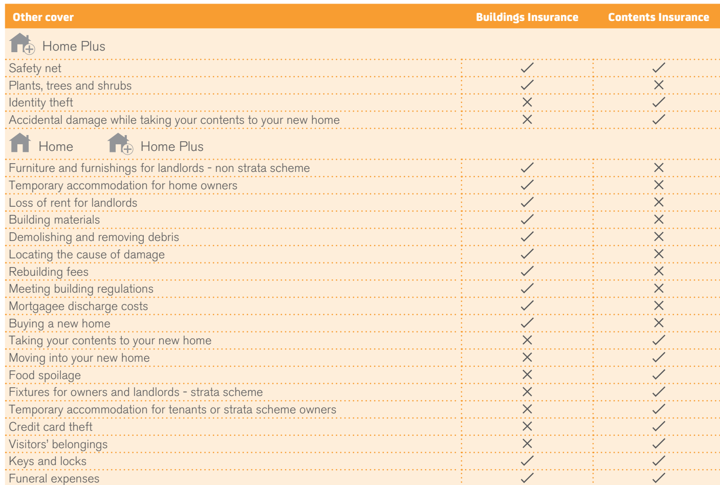
Table 3.2 – Other cover